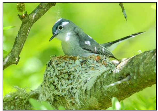
Blue-gray Gnatcatcher, Dekalb County, Georgia—April 11, 2020

Shorebirds are also migrating and can be found along the edges of ponds or in flooded fields. I was delighted to find my first Solitary Sandpiper and Lesser Yellowlegs of the year and they were right next to each other! Note that Solitary Sandpipers are smaller and browner than Lesser Yellowlegs with a green bill.