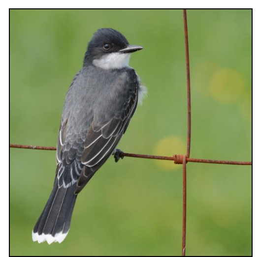
Eastern Kingbird, Bartow County, Georgia—April 18, 2020

By mid-April, migrant songbirds that breed in the Georgia Piedmont are already building nests and laying eggs. I spotted this male Blue-gray Gnatcatcher putting the finishing touches on its nest in a Honey Locust tree at Stone Mountain Park.