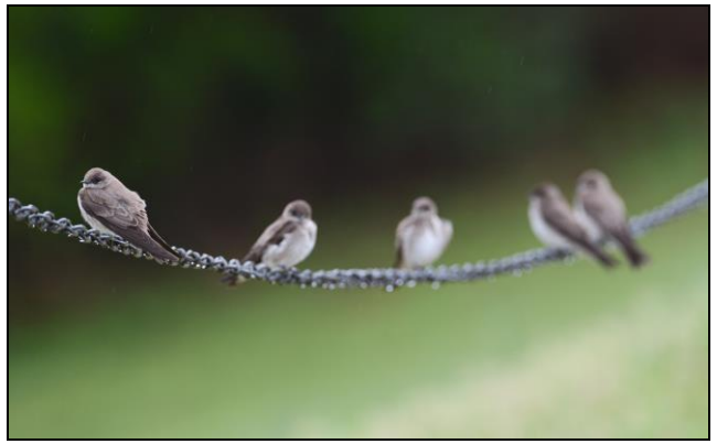
Northern Rough-winged Swallows, Clarke County, Georgia—March 23, 2020

As winter transitions to spring, billions of birds leave their wintering grounds in Athens and points farther south to migrate north to their breeding grounds. Here are a couple of my highlights from birding (while social distancing of course!) over the past few weeks: