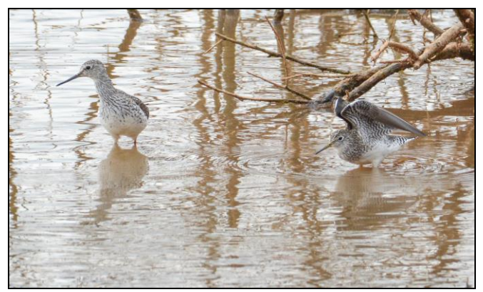
Solitary Sandpiper and Lesser Yellowlegs by Patrick Maurice, Walton County, Georgia—March 28, 2020

Birding after storms during migration can be especially rewarding because many migrants will be forced to put their migration "on pause" and seek shelter in natural and artificial habitats. I found a break in the radar and checked Lake Herrick on March 23<sup>rd</sup>. I was rewarded by finding two new birds for my Clarke County list (Double-crested Cormorant and Blue-winged Teal), and a large flock of 26 Northern Rough-winged Swallows with a single Tree Swallow mixed in.