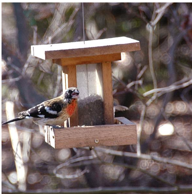
Booger Hill Rd., Madison County— February 7, 2015

Non Profit Org. U.S. Postage Paid Athens, GA Permit No. 41