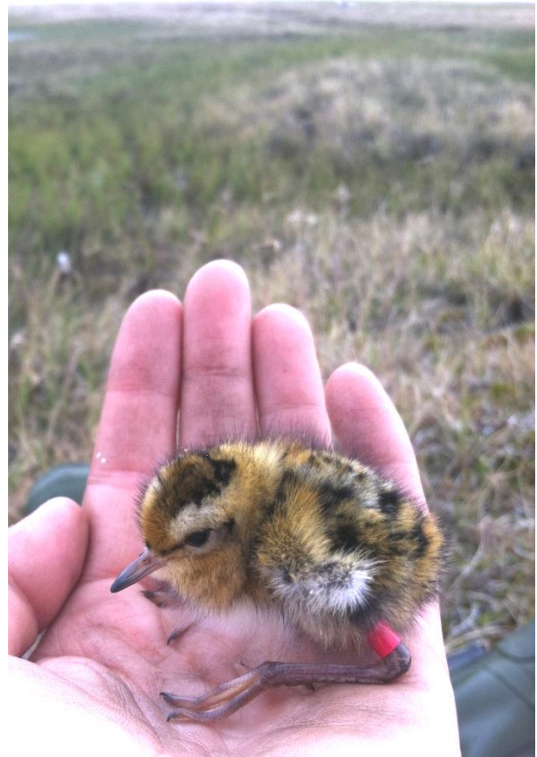
Barrow, Alaska, June 2014

Many times, when we see large flocks of shorebirds feeding and resting, they are urgently refueling for the next leg of their journey. Understanding our responsibility to share beaches with these migrating birds can help enrich our beach-going experience. These feathered gypsies are connecting the entire hemisphere. Observing them and educating people about their journeys is the least we can do.