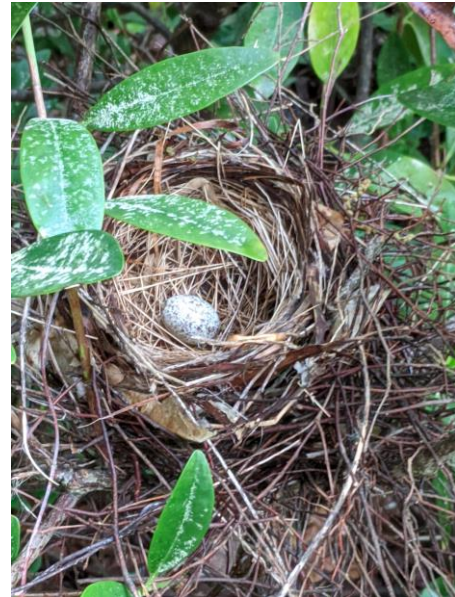
Northern Cardinal nest, in yard, Clarke County—April 9, 2020