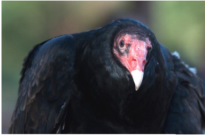
Turkey Vulture, Athens-Clarke County Landfill—Oct. 24, 2015