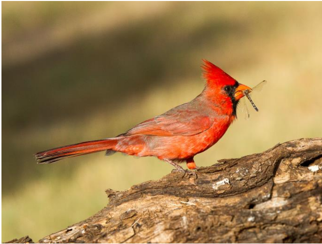
Northern Cardinal, Laguna Seca Ranch, Edinburg, Texas—October 23, 2012

Sun-dappled, rank growth, Glimpse of bright, red fluttering, Cardinal peep show!